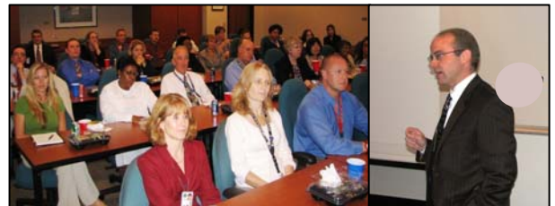
Approx. 100 Attendees